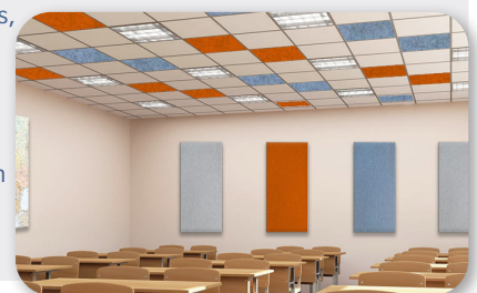
Ceiling: soni COLOR RD / Wall: soni COLOR